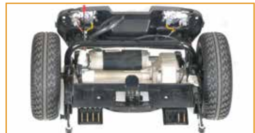
Quiet & maintenance free motor