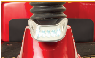
Angle adjustable LED headlight creates a wide path of bright light