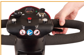
EZ Reach tiller adjustment