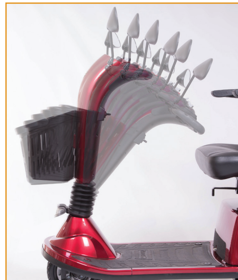
Patented infinite adjustable tiller