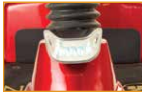
Angle adjustable LED headlight creates a wide path of bright light