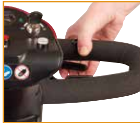
EZ Reach tiller adjustment