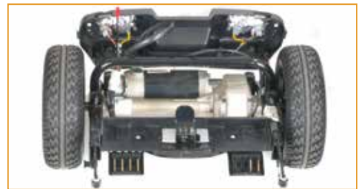
Quiet & maintenance free motor