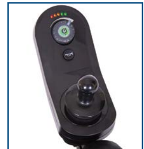
Ergonomic LiNX controller