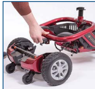
Disassembles easily for transport!