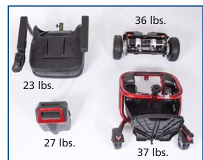
Perfect for transport!

Some accessories require a mounting bracket or mounting clips.