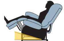
Lounge in Twilight