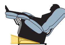
TV in Twilight