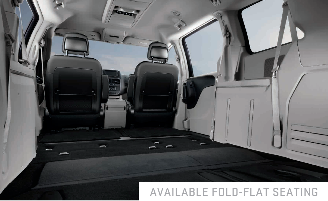
AVAILABLE FOLD-FLAT SEATING