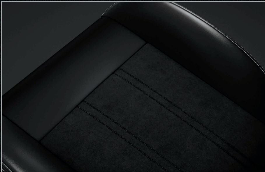
Premium seats in Black with suede inserts and Silver accent stitching — standard on SXT; included with Blacktop Package on SXT