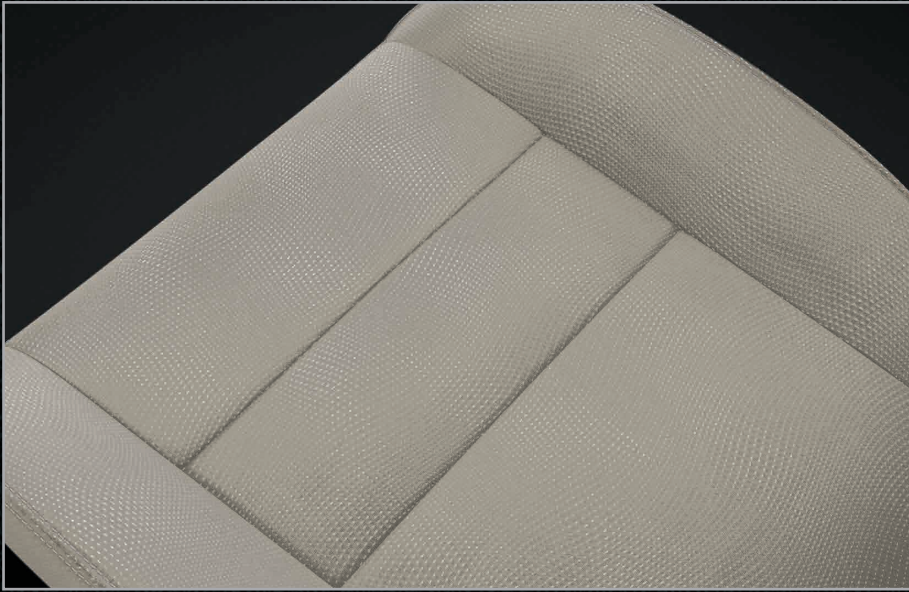
Hudson cloth in Light Graystone (also available in Black) — standard on SE