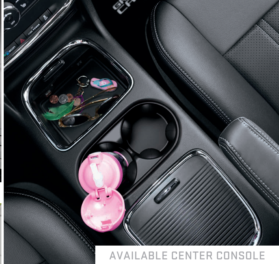
AVAILABLE CENTER CONSOLE