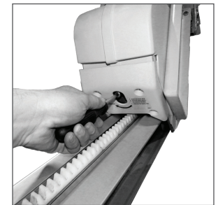
Manual Hand Crank