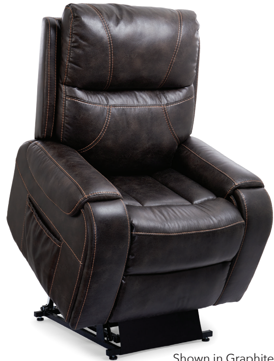
Shown in Graphite