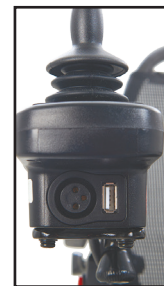
Convenient USB Charging Port