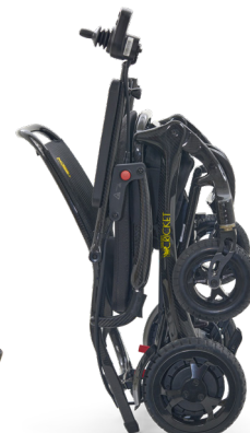
Stands on End for Storage