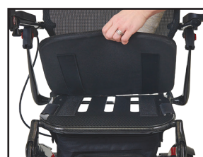
Removable 1.25" Thick Padded Seat