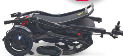
East One-Step Folding for Transport