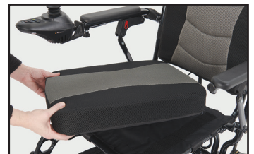
Removable Padded Seat