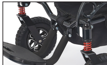
Comfort Spring Suspension for a Smooth Ride