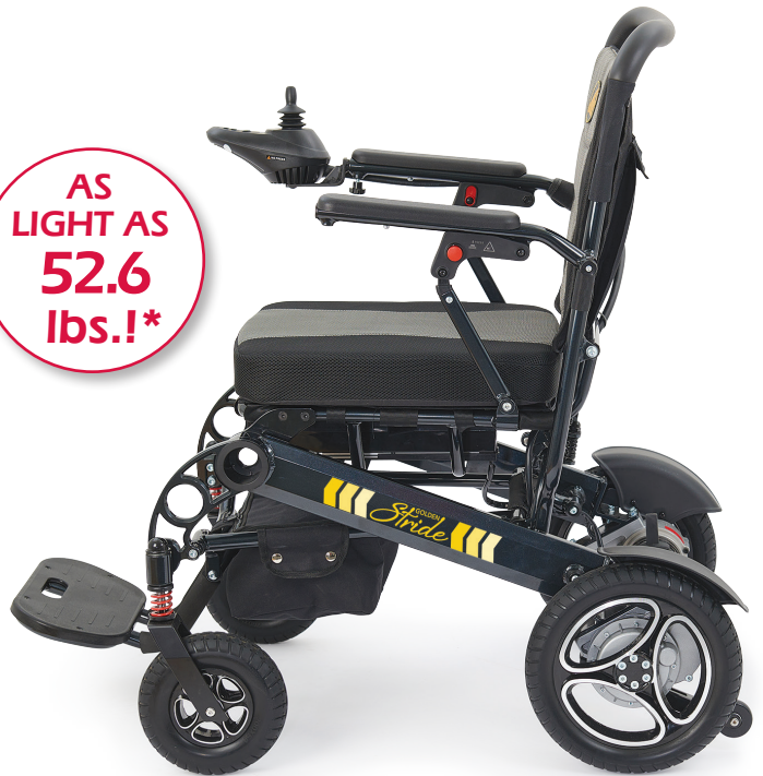
Portable & high-performing with an aluminum frame!