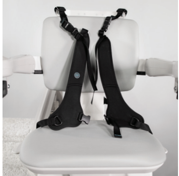
Not all options are shown.