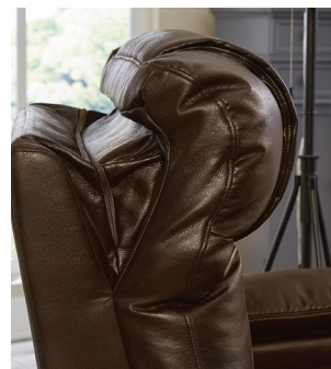
Adjustable Headrest & Lumbar