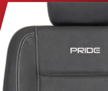
High-back memory foam seat