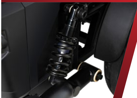
Front and rear independent Active-Trac® ATX Suspension