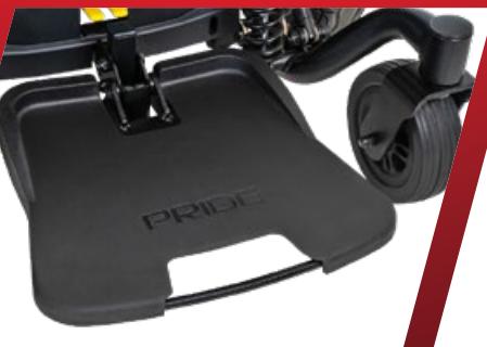
Large footplate with removable rubber cover for easy cleaning